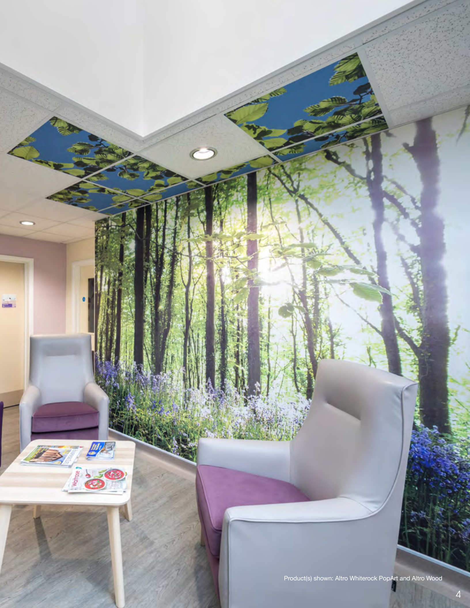
Product(s) shown: Altro Whiterock PopArt and Altro Wood