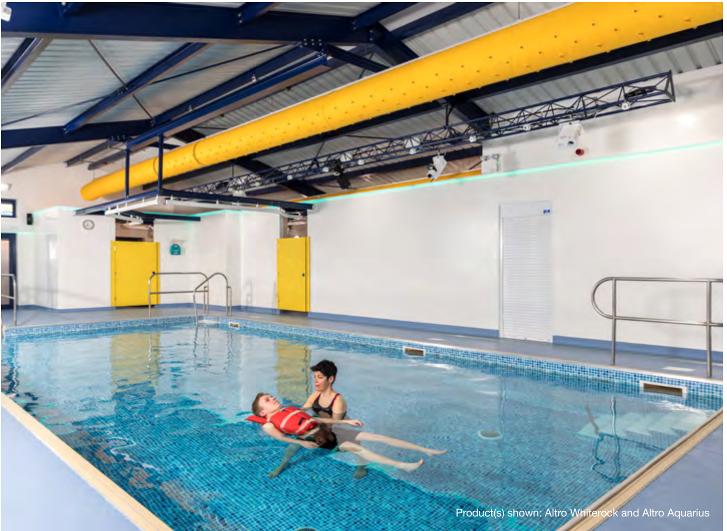
Product(s) shown: Altro Whiterock and Altro Aquarius