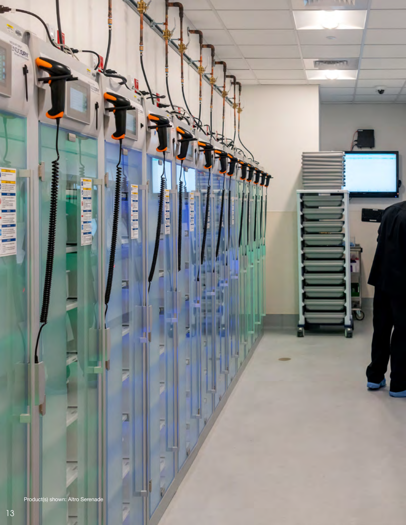
Product(s) shown: Altro Serenade