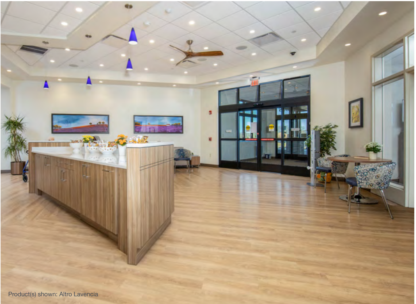
Product(s) shown: Altro Lavencia