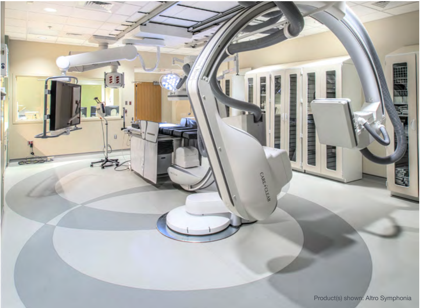
Product(s) shown: Altro Symphonia