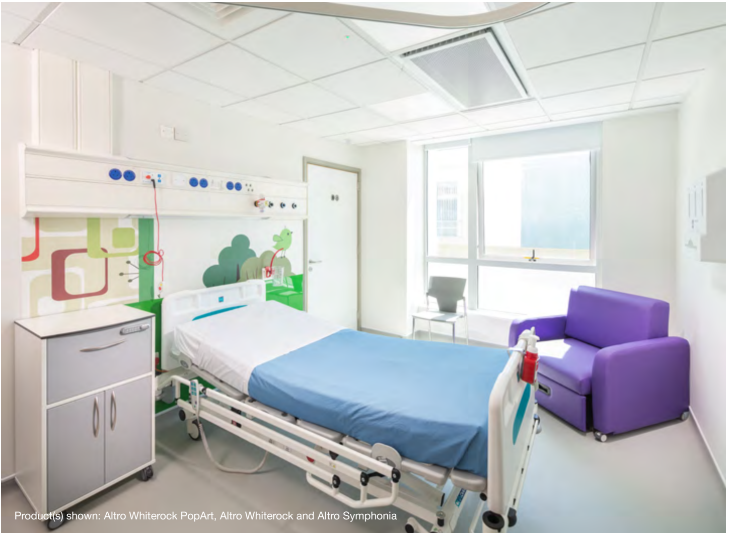
Product(s) shown: Altro Whiterock PopArt, Altro Whiterock and Altro Symphonia