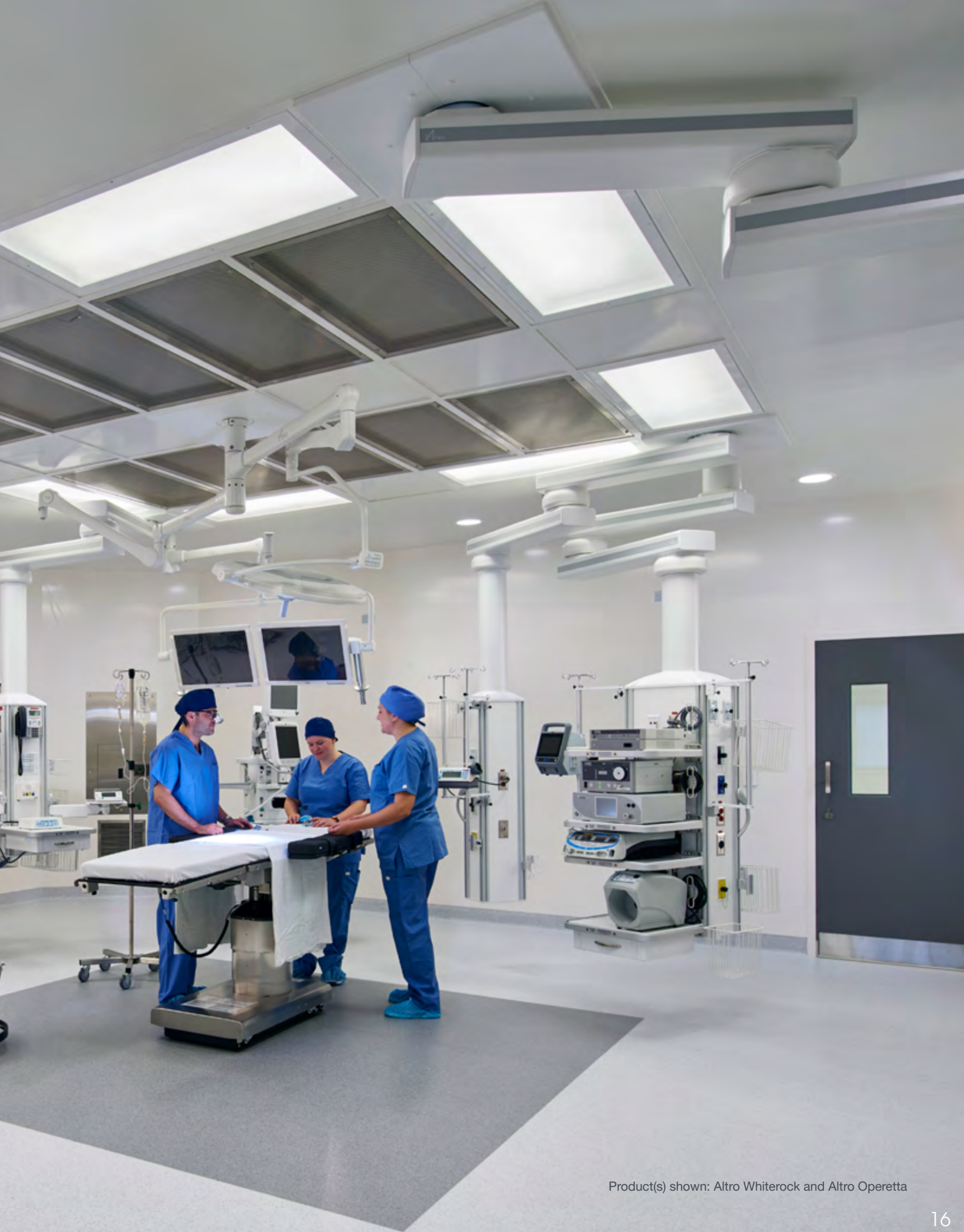
Product(s) shown: Altro Whiterock and Altro Operetta