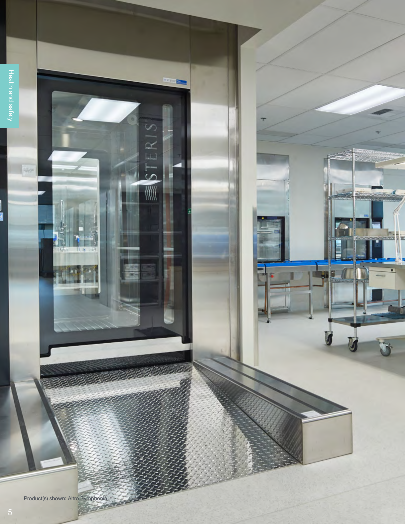
Product(s) shown: Alto Symphonia