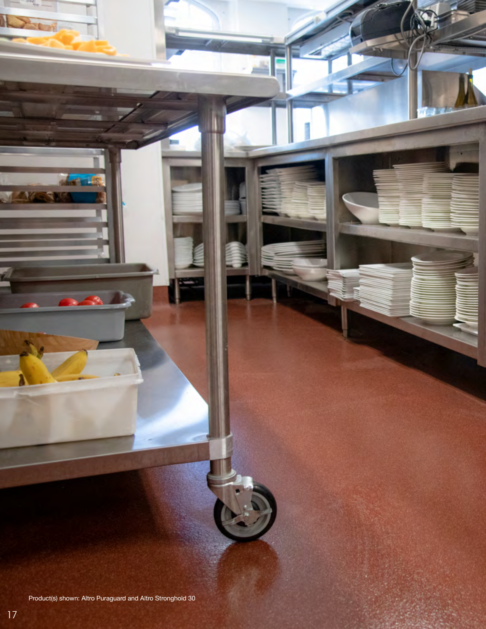
Product(s) shown: Altro Puraguard and Altro Stronghold 30