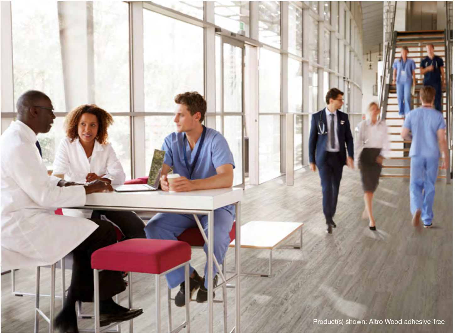
Product(s) shown: Altro Wood adhesive-free