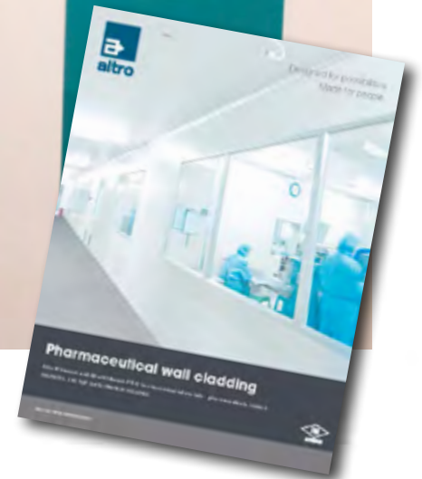
Product(s) shown: Altro Whiterock Chameleon

Altro floor and wall products have been tested against many commonly used chemicals including sodium hypochlorite, phenolic disinfectants and germicidal cleaners like Preempt and Simple Green D. To view a full report on these results, visit our website.