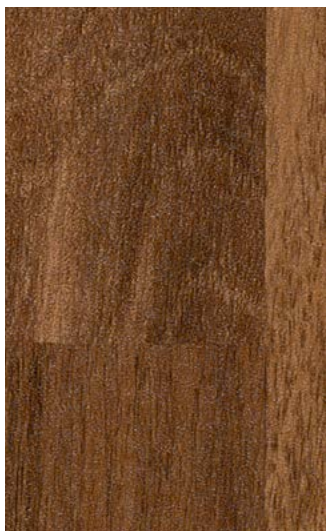
Antique Walnut Comfort WSMSC2810 WR341 / AM160 LRV 15