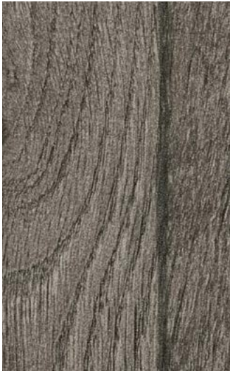
Worn Oak Comfort WSMSC2818 WR322 / AM239 LRV 19