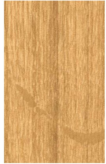
Rustic Oak Comfort WSMSC2805 WR340 / AM340 LRV 37