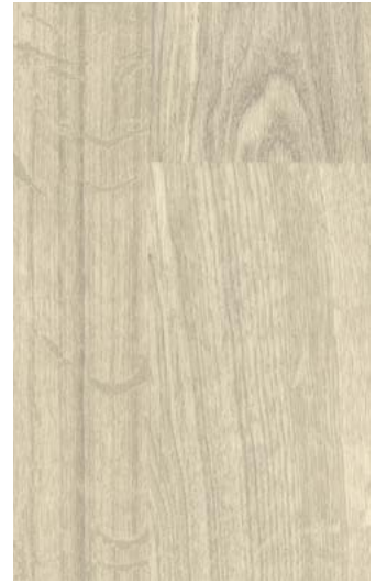
Blchd. Oak Comfort WSMSC2801 WR335 / AM335 LRV 52