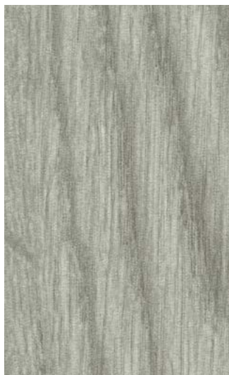
Washed Oak Comfort WSMSC2808 WR347 / AM347 LRV 38