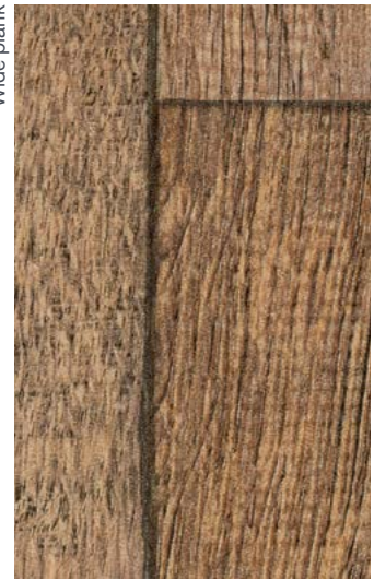
Great Oak Comfort WSMSC2817 WR339 / AM339 LRV 22