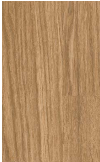
Oak Trad. Comfort WSMSC2807 WR353 / AM225 LRV 25