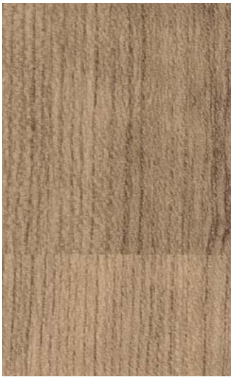
Autumn Maple Comfort WSMSC2802 WR339 / AM339 LRV 24