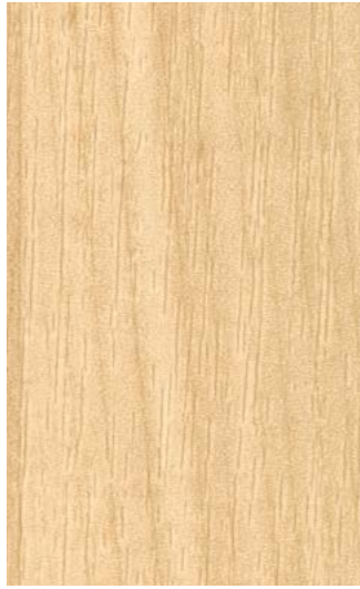
Honey Beech Comfort WSMSC2829 WR462 / AM462 LRV 43