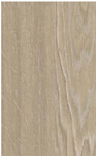
Sessile Oak Comfort WSMSC2823 WR350 / AM483 LRV 30