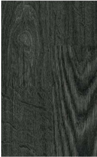
Manor Oak Comfort WSMSC2809 WR348 / AM348 LRV 7