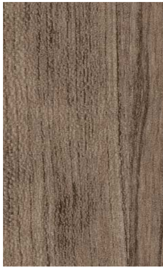
Urban Cherry Comfort WSMSC2804 WR337 / AM337 LRV 17