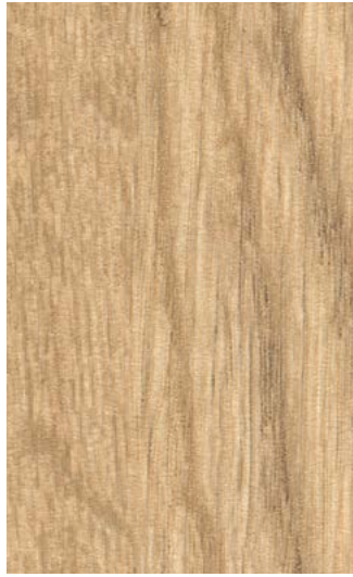
Farmhouse Oak Comfort WSMSC2811 WR338 / AM338 LRV 38