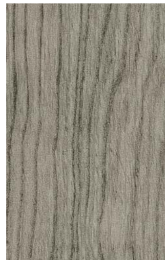
Vintage Cherry Comfort WSMSC2803 WR336 / AM239 LRV 22

Always approve a physical sample before placing a material order. Image quality can vary and small swatches may not show the full pattern.