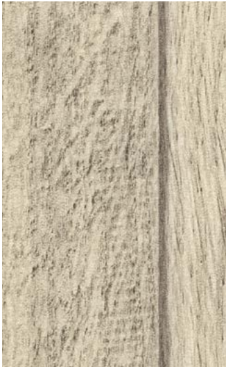
Castle Oak Comfort WSMSC2816 WR335 / AM335 LRV 51