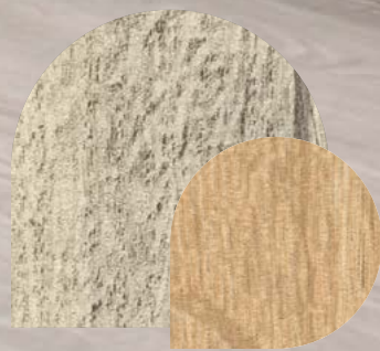
Manet Community Health Centre chose Altro Wood.