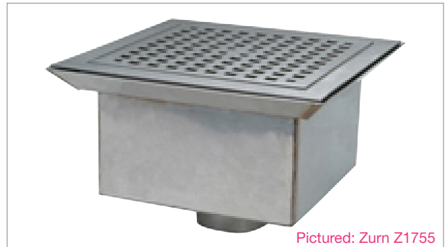
Pictured: Zurn Z1755

Floor Sinks are used primarily in kitchens and laboratories and they can be either porcelain or stainless steel. Floor sinks are commonly misunderstood and both used and installed incorrectly (for particulars of the use of mechanical/plumbing fixtures and their application please consult the current edition of the Uniform Mechanical Code). While porcelain floor sinks are seen in many kitchens and are frequently specified and used, these porcelain fixtures do not come in a surface membrane clamping type that Altro recommends. If a porcelain floor sink is specified and used then Altro's gully angle/edge is required to be fit and installed around the floor sink. This requires saw cutting into the concrete and flooring, then fitting to the gully angle/edge and heat-welded to it (the application of gully angle/edge cannot be used on wood subfloors). It is Altro's first choice and recommended preference that, whenever possible, floor sinks be of a surface membrane clamping type.