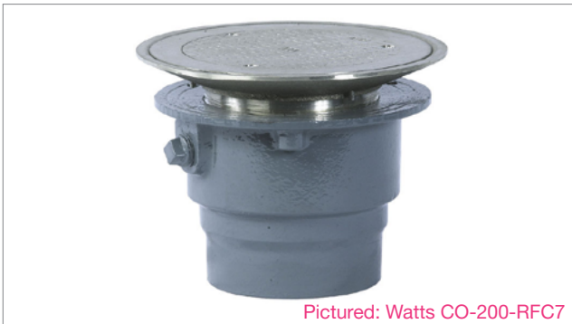
Pictured: Watts CO-200-RFC7

Round Cleanouts are found where cleanout access of the plumbing drainage system is required, these fixtures also need to be of a surface membrane clamping type.