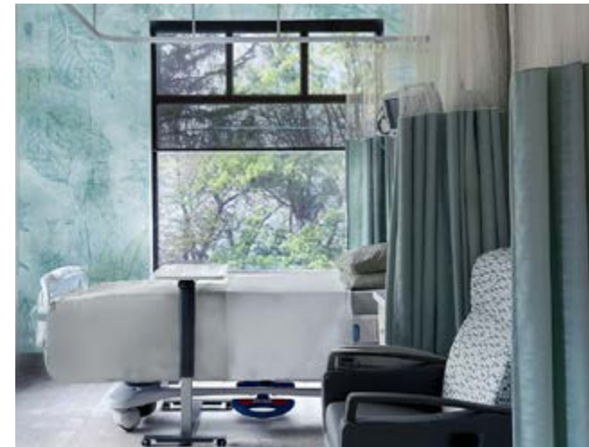
1. Altro Whiterock PopArt