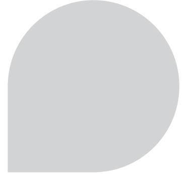
Vintage Cherry TFWSA2202F (2.2mm) WR336 / A1M239