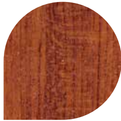
Seasoned Cherry TFWSA2209F (2.2mm) WR343 / A1M246