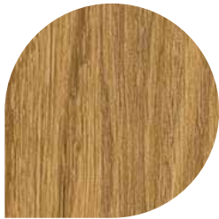
Oak Traditions TFWSA2213F (2.2mm) WR353 / A1M225