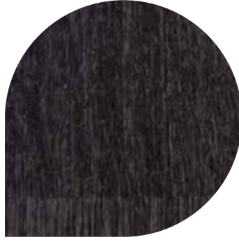
Manor Oak TFWSA2216F (2.2mm) WR348 / A1M348