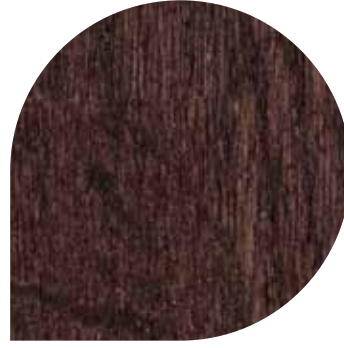
Century Oak TFWSA2212F (2.2mm) WR346 / A1M62