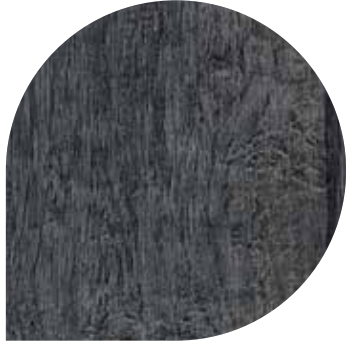
Jacobean Oak TFWSA2222F (2.2mm) WR470 / A1M83