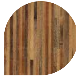
Spiced Bamboo TFWSA2219F (2.2mm) WR342 / A1M224