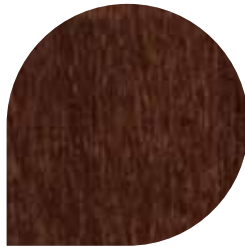
Oak Riche TFWSA2214F (2.2mm) WR227 / A1M227