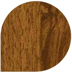
Antique Walnut TFWSA2207F (2.2mm) WR341 / A1M160