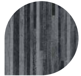
Iron Bamboo FWSA2226F (2.2mm) WR232 / A1M100