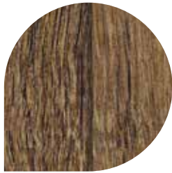
Tudor Oak TFWSA2223F (2.2mm) WR471 / A1M337