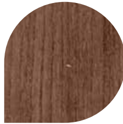
Urban Cherry TFWSA2203F (2.2mm) WR337 / A1M337