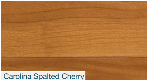
Carolina Spalted Cherry

Nosings, t-moulds, and reducers in 94" lengths