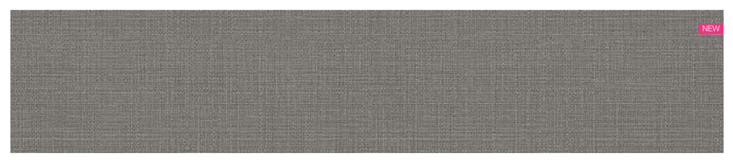
Interlace LAV16099 Coordinates with Altro Orchestra Chant, Altro Operetta Quintet and Altro Serenade Metronome