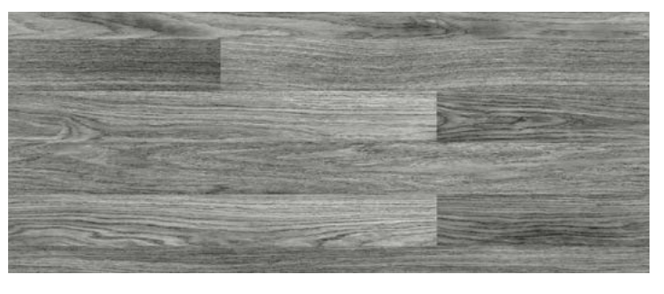
Ansel Oak LAV14044