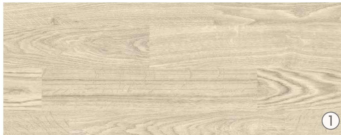
1. Altro Wood™ adhesive-free Frosted Oak