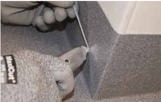
7. Trim flooring as required to form a tight neat joint.