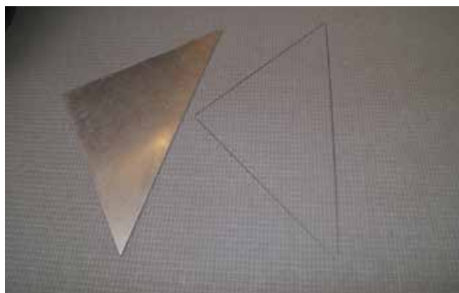
2. Use triangular pattern to cut corner shape from material.