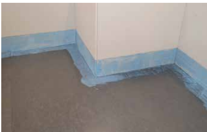
1. Apply adhesive to the floor and wall where material is to be covered.

A 3mm groove must be cut evenly along each corner seam. Welds should be done using a hot air welding gum with a 5mm high speed welding nozzle. Allow corner welds to cool to a suitable temperature before trimming using a suitable tool.