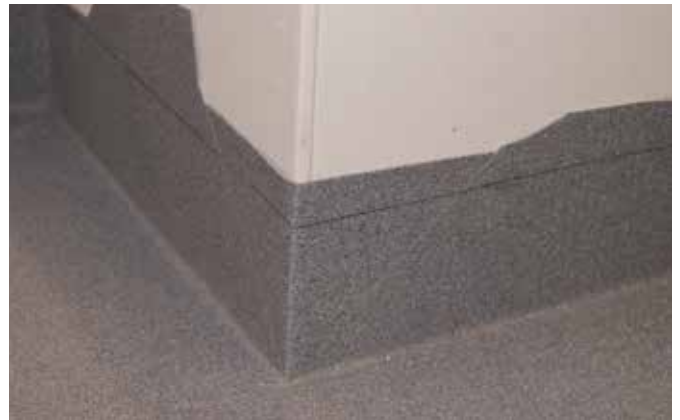
8. After trimming, roll material with a hand roller to ensure good contact with the adhesive surface and eliminate any trapped air.