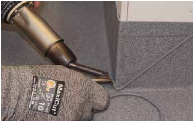
11. Weld external corner.