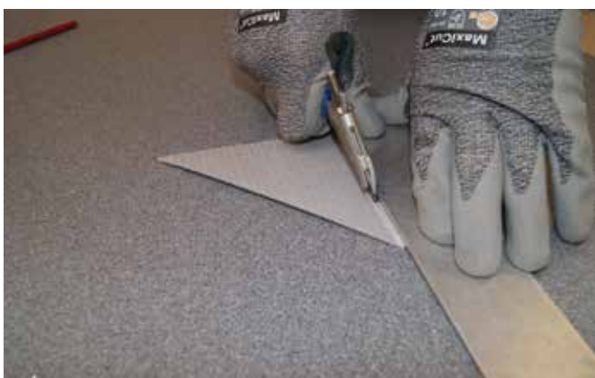
3. Groove the back of material out approximately 1/3rd depth at the point where the pad out section will be on the corner of the wall.