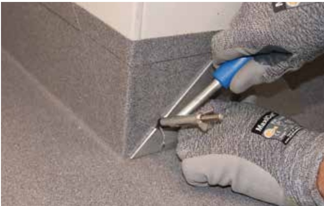
9. Groove flooring on external corner using the triangular template as a guide.