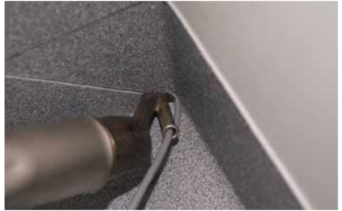
12. Weld internal corner.