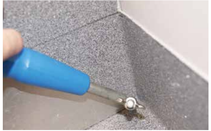
10. Groove flooring in internal corner using the triangular template as a guide.