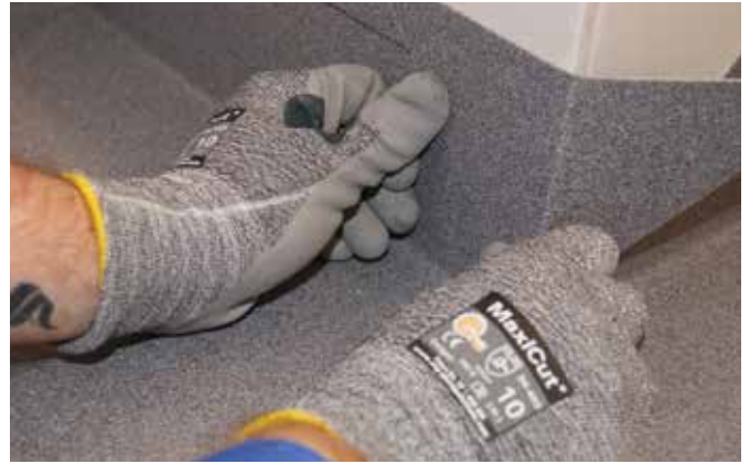
6. Place material into position.