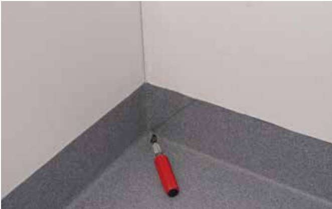
13. Trim weld back to the surface of the material.

For further information or technical advice tel: 01462 707600 fax: 01462 707515 email: enquiries@altro.com or explore www.altro.com