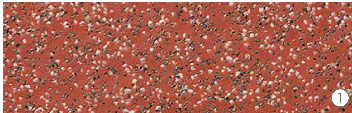
1. Altro Stronghold™ 30