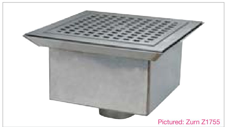
Pictured: Zurn Z1755

Floor sinks are primarily used in kitchens and laboratories. While porcelain floor sinks are commonly used and specified, these are NOT a surface membrane clamping style that Altro recommends. Altro gulley edge/angle is required to be fit and installed around a porcelain floor sink. Gulley edge/angle cannot be used on wood substrates. See our flooring installation guide for more information on installing Altro gulley edge/angle on altro.com .