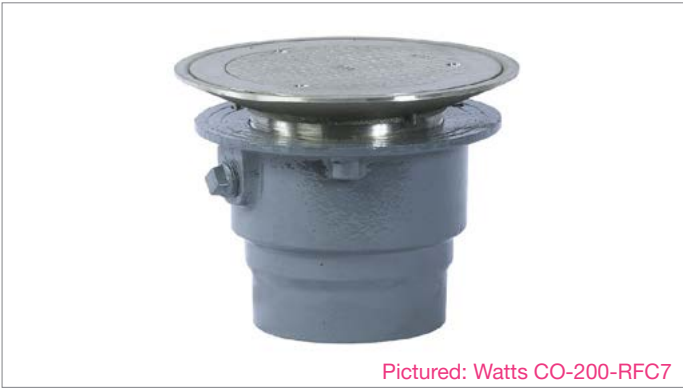
Pictured: Watts CO-200-RFC7

Cleanout drains are found where cleanout access to the plumbing drainage system is required.