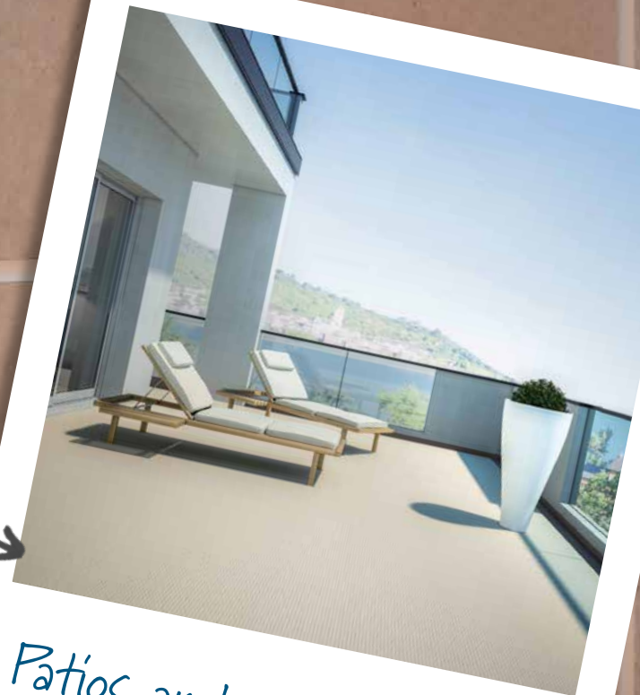
Patios and pool surrounds

Product shown in background: Altro Tegulis in Cool Mineral with stacked tile design