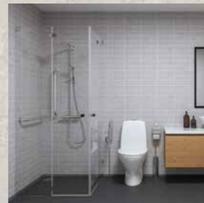
Durable, hygienic and easy to clean walls systems

Altro Aquarius and Altro Pisces deliver slip resistance of up to one in a million with water and common contaminants including shampoo and conditioner