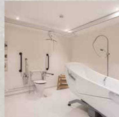
Altro Pisces: lowers the risk of slips in shoes AND bare feet