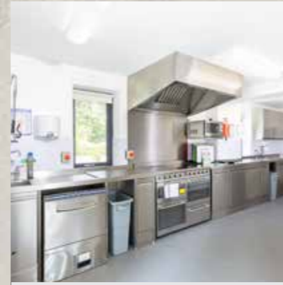
Altro Stronghold 30: one in a million slip risk with grease, oils and fats

Altro floors and walls have long guarantees and technical support for life. Our safety floors offer sustained slip resistance for the life of the floor.