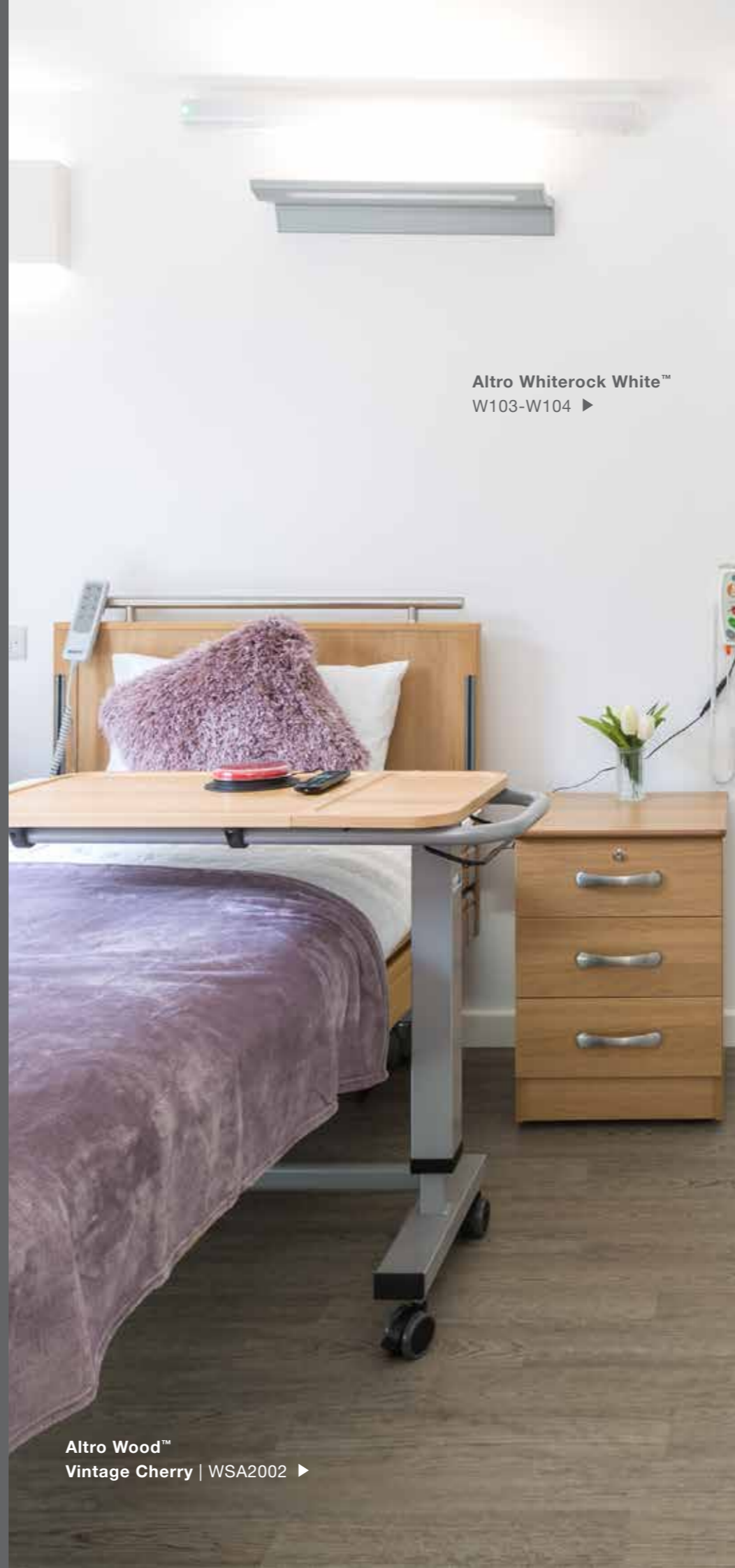
Altro Whiterock White™ W103-W104 ▶

Enhance safety: Proper contrast between surfaces, furniture, and objects is essential for residents with visual impairments. Dementia can affect colour differentiation, making it important to use contrasting colours to help residents navigate their space safely.