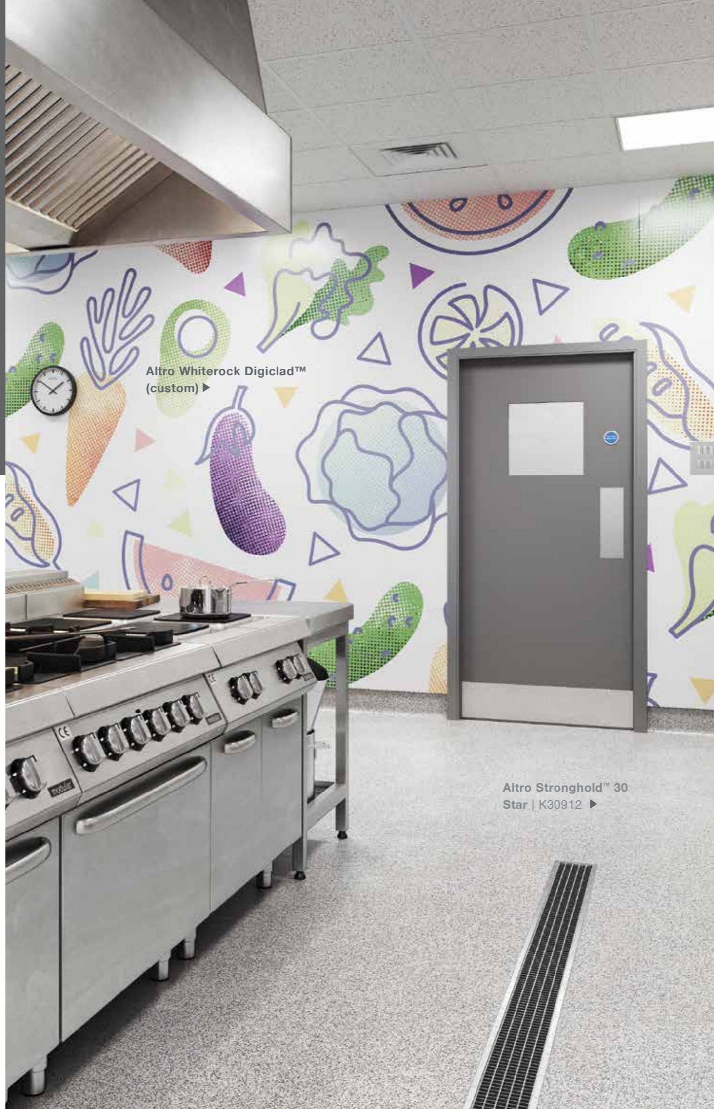
Altro Whiterock Digiclad™ (custom) ▶

Altro walls and doors, combined with Altro safety or Altro smooth floors, create an impervious and easy to clean system that meets the hygienic requirements of even the most critical care environments. Altro walls and doors can be cleaned by wiping, steam cleaning or power washing – it's as simple as that. No grout to trap dirt, and impact-resistant, so none of the issues associated with cracked tiles or damaged paint.