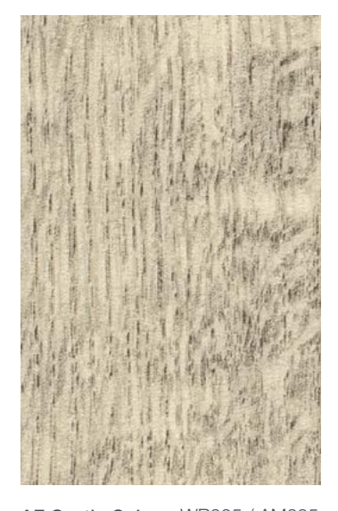
AF Castle Oak AFW280013