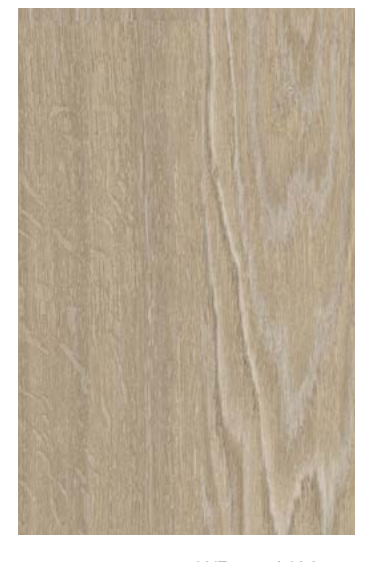
AF Sessile Oak WR350 / AM483 AFW280016 LRV 30