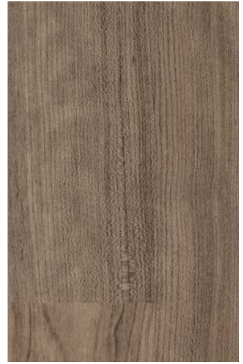
AF Urb. Cherry WR337 / AM337 AFW280004 LRV 17