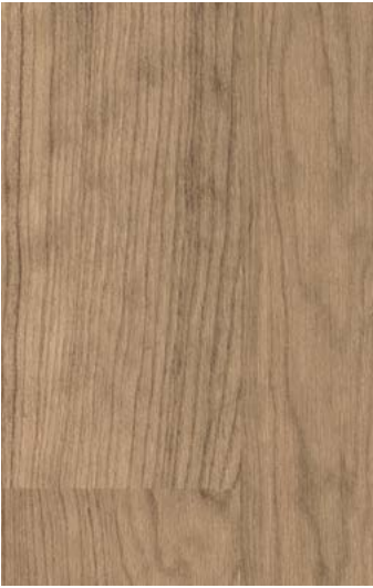
AF Aut. Maple WR339 / AM339 AFW280002 LRV 24