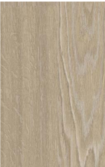
AF Sessile Oak WR350 / AM483 AFW280016 LRV 30