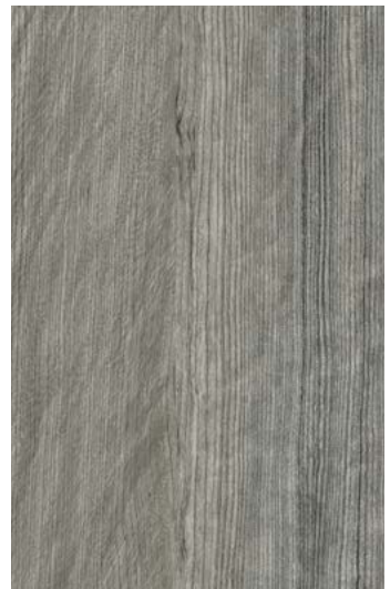
AF Slate Oak WR478 / AM390 AFW280018 LRV 26

Always approve a physical sample before placing a material order. Image quality can vary and small swatches may not show the full pattern.