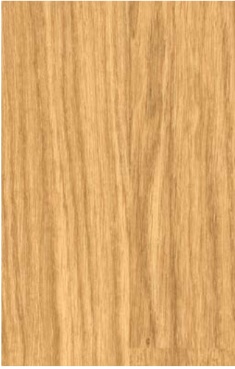
AF Rustic Oak WR340 / AM340 AFW280005 LRV 37