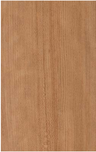
AF Spg. Maple WR352 / AM352 AFW280011 LRV 27