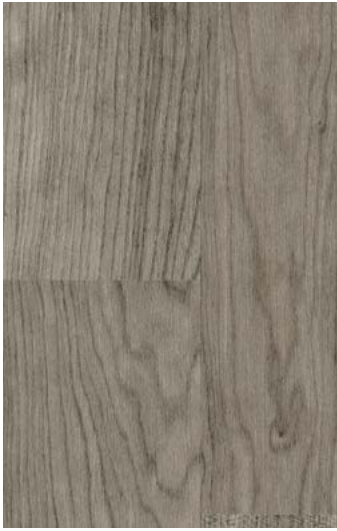
AF Vint. Cherry WR336 / AM239 AFW280003 LRV 22