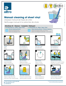
Illus. cleaning guides