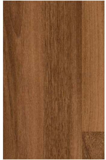
AF Ant. Walnut WR341 / AM160 AFW280009 LRV 15