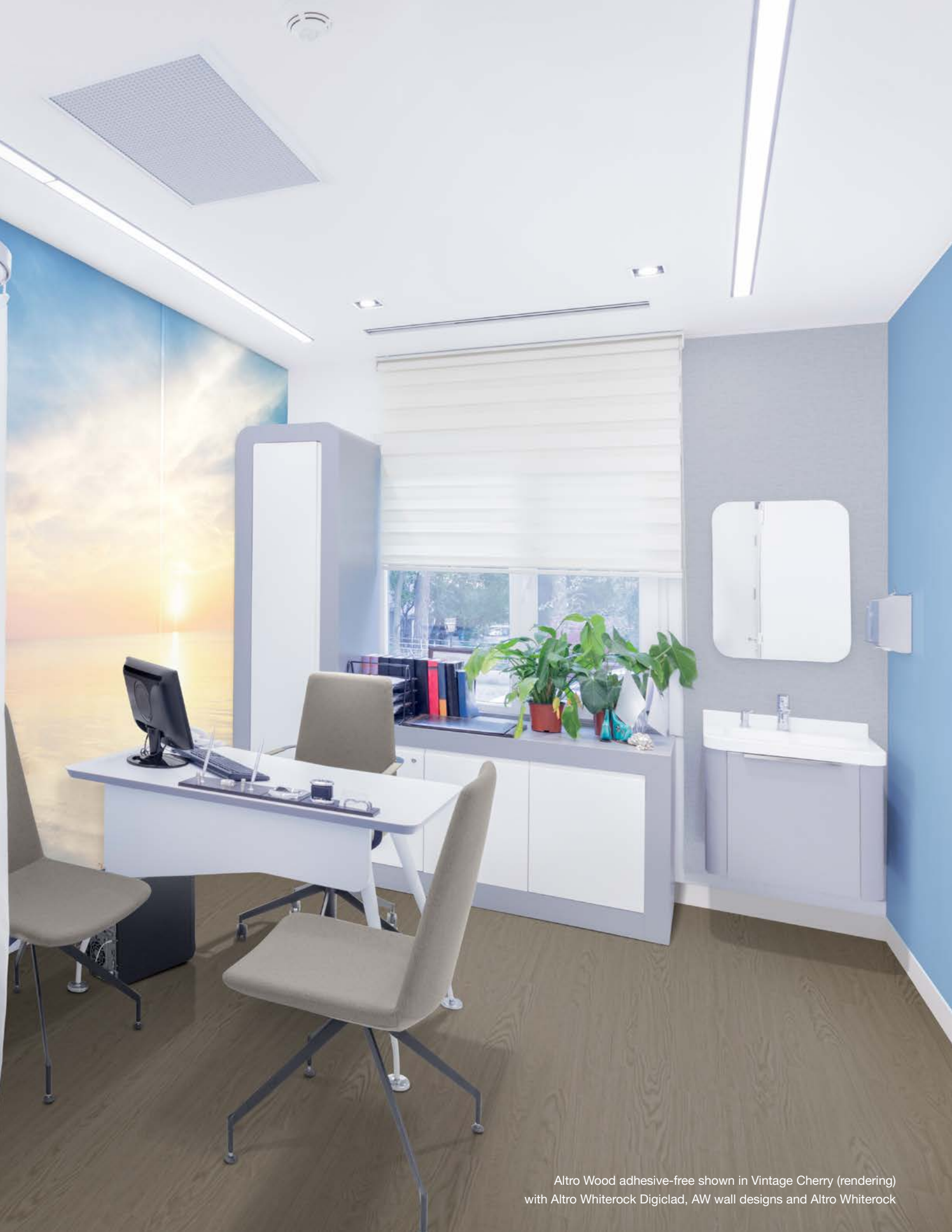
Altro Wood adhesive-free shown in Vintage Cherry (rendering) with Altro Whiterock Digiclad, AW wall designs and Altro Whiterock