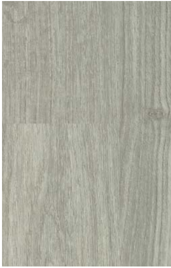
AF Wash. Oak WR347 / AM347 AFW280007 LRV 38