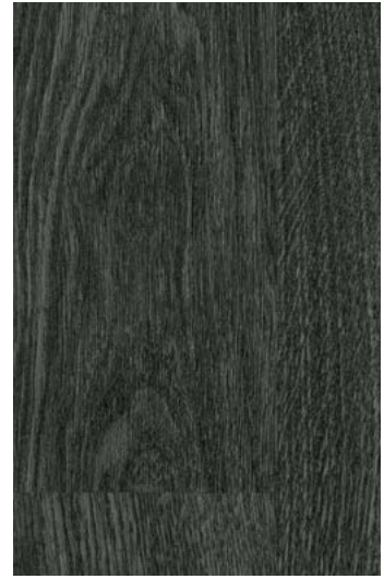
AF Manor Oak WR348 / AM348 AFW280008 LRV 7