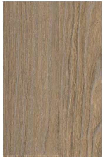
AF Bav. Oak WR514 / AM514 AFW280015 LRV 21

Always approve a physical sample before placing a material order. Image quality can vary and small swatches may not show the full pattern.