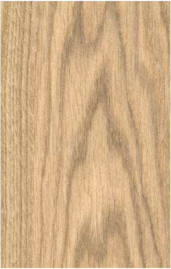
AF Farm. Oak WR338 / AM338 AFW280010 LRV 38