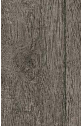
AF Worn Oak WR322 / AM239 AFW280012 LRV 19