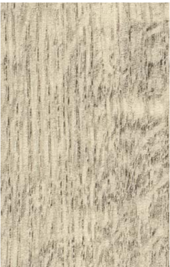
AF Castle Oak WR335 / AM335 AFW280013 LRV 51