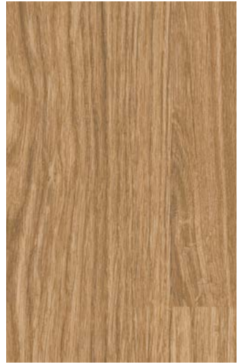
AF Oak Trad. WR353 / AM225 AFW280006 LRV 25