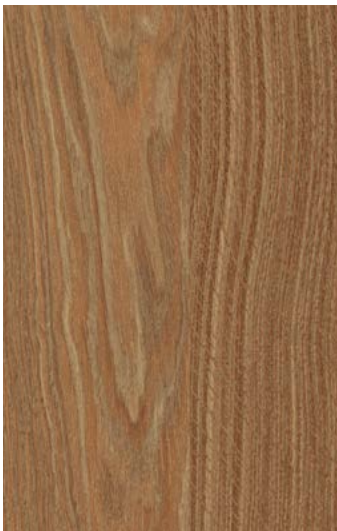
AF Honey Oak WR352 / AM352 AFW280017 LRV 21