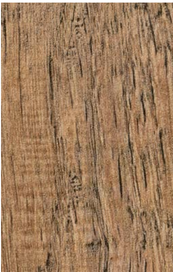
AF Great Oak WR339 / AM339 AFW280014 LRV 22