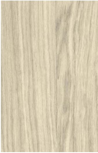
AF Bleach. Oak WR335 / AM335 AFW280001 LRV 52