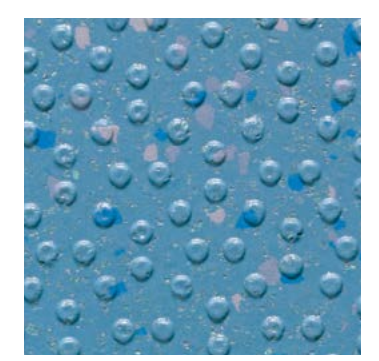
Tide WR71 / AM71

Color matched weldrods (WR) and mastic (AM) are available. You'll find their product codes under product SKUs.