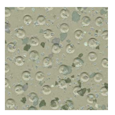
Seagrass WR137 / AM137