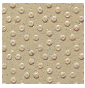
Reef WR20 / AM20