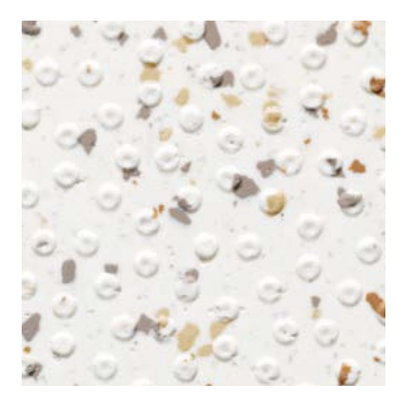
Cascade WR105 / AM01