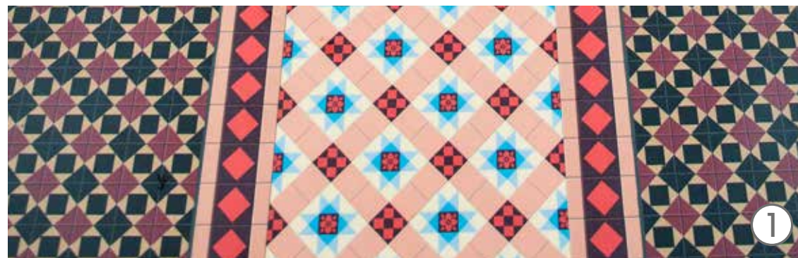
1. Altro Transflor Metris™ Custom