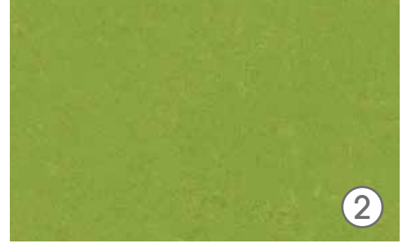
Altro Whiterock Digiclad<sup>™</sup> Altro Serenade<sup>™</sup>