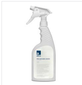
P/N: A809 Anti-Static Solution in spray bottle 500ml