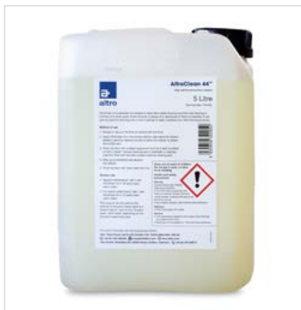
P/N: FC445L AltroClean 44 - 5 Liters 1.3 Gallons

The following maintenance products are available to purchase