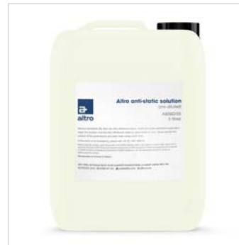
P/N: A809/05 Anti-Static Solution 5 Liters

Labels may indicate that they are exclusively for Altro Whiterock. Please note, cleaning agents may be used for all Altro wall panels named above.