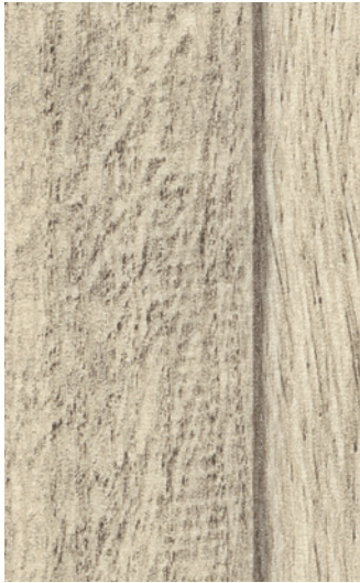
Castle Oak Acoustic WSMA3798 WR335 / AM335 LRV 51