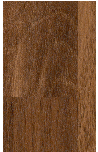
Antique Walnut Acoustic WSMA3782 WR341 / AM160 LRV 15