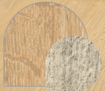
Salisbury Hospital chose Altro Wood.