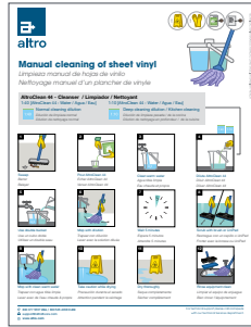
Illus. cleaning guides