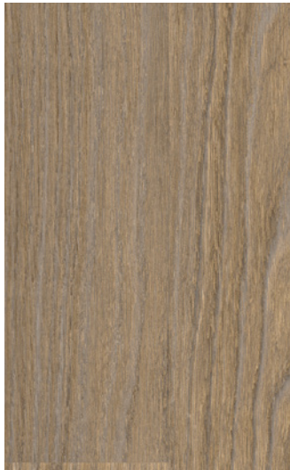
Bavarian Oak Acoustic WSMA37104 WR514 / AM514 LRV 21