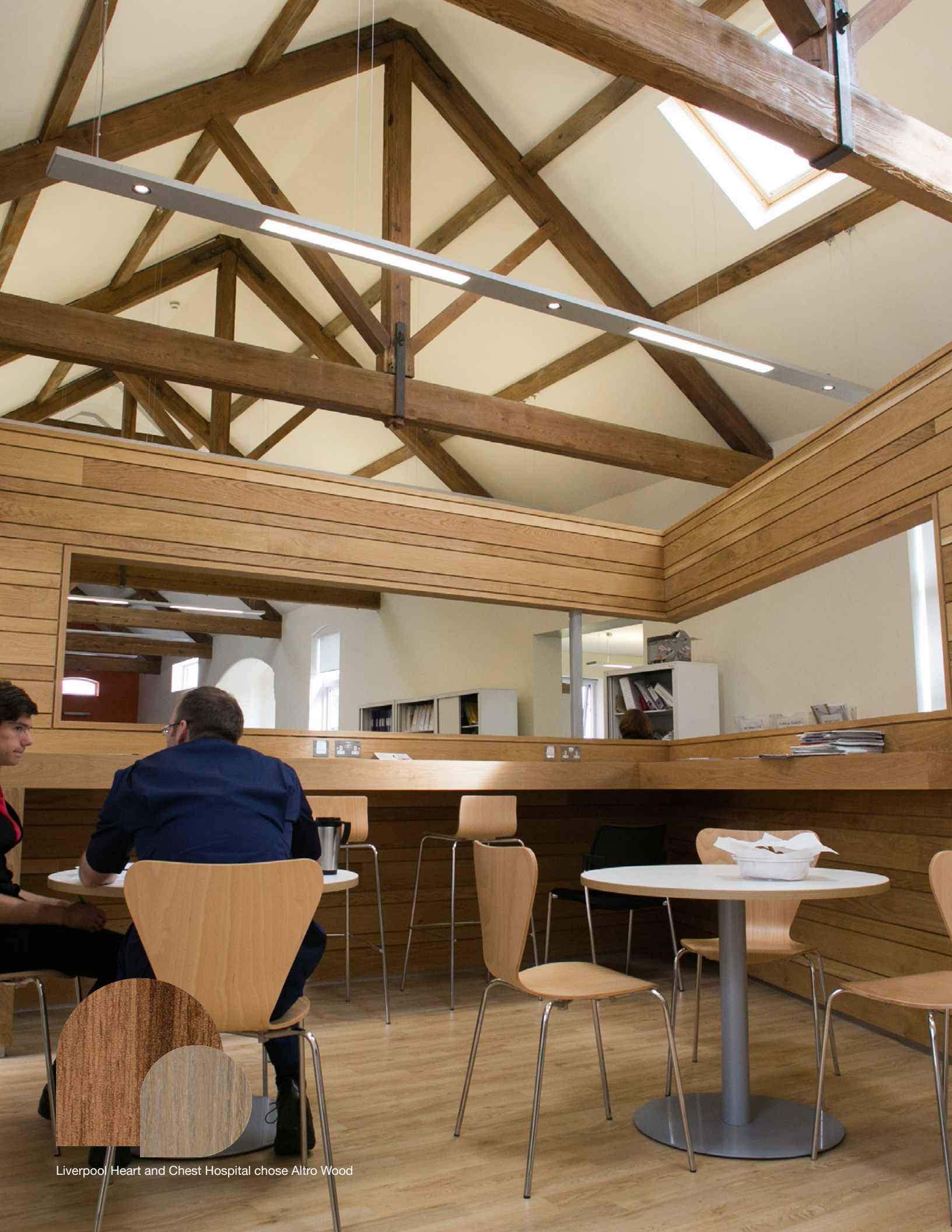
Liverpool Heart and Chest Hospital chose Altro Wood