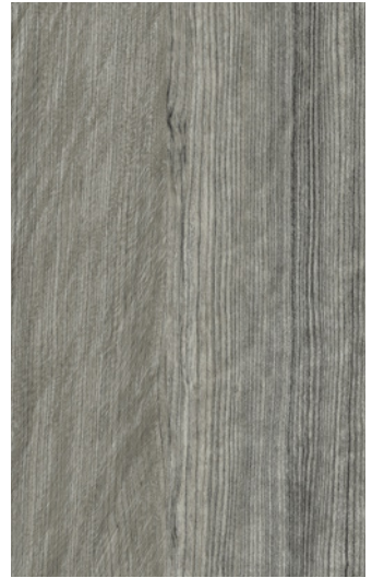
Slate Oak Acoustic WSMA37108 WR478 / AM390 LRV 26