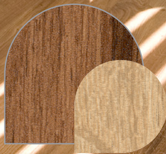
Colors shown: Antique Walnut and Farmhouse Oak