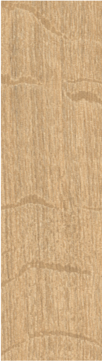
Farmhouse Oak Acoustic WSMA3781 WR338 / AM338 LRV 38